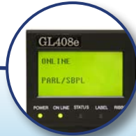
Large LCD Display Panel